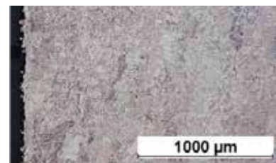
Microstructure after HIP